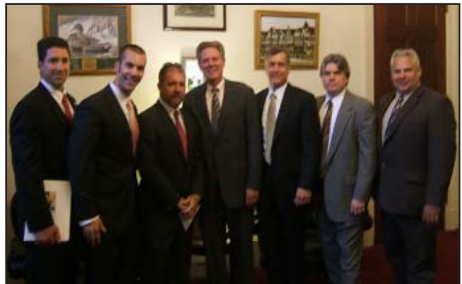
UTCA officers, directors and staff are pictured with Congressman Frank Pallone.

Also on our agenda was the recently introduced Kerry-Lieberman climate change bill. Of great concern is a provision that would use revenue from a federal motor fuel tax increase for non-transportation related items. UTCA will continue to update its members relative to these important issues as the summer progresses.