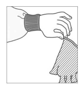
Peel off from inside, creating a bag for both gloves.